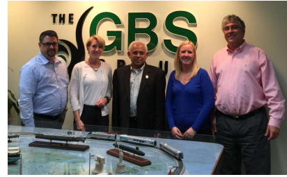
Nov 2015 - Consulting work related to implementing the process based management system approach with the GBS Group in Virginia Beach.