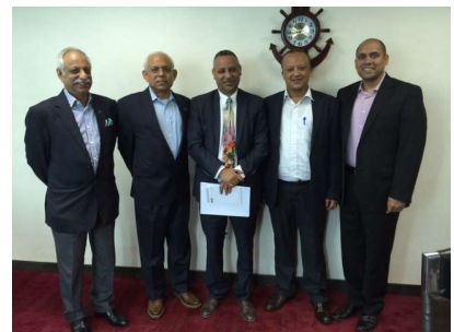
Jan 2015 - EMAA Top Management are committed to making EMAA a leading Flag State.