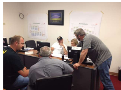
July 2015 - FMEA training for the US Army. Students are engaged in a group exercise to reinforce learning.