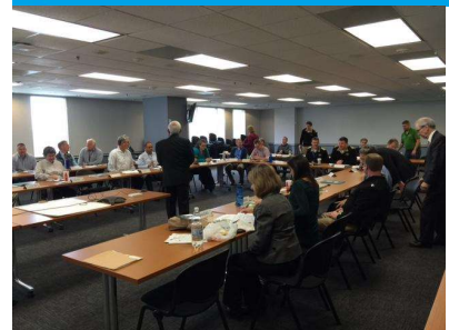
Jan 2015 - Leadership Overview for NOAA by QMII President and CEO.