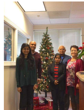
Dec 2015 - The QMII Team illuminated the HQ office with a Christmas tree and festive decorations.

To see more of our work in pictures, visit our Facebook page .