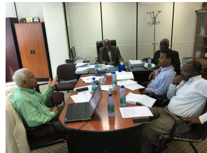
Jun 2015 - Working with the Maritime Authority in Addis Ababa, Ethiopia.