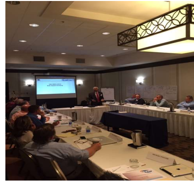
May 2015 - TVIB Board being addressed by President and CEO at conference.

2015 was an eventful year for QMII. We are happy to report a 100% satisfaction level conveyed to us by our alumni and clients. It has been our endeavor to be stakeholders in our client's success. Very consciously we have refrained from