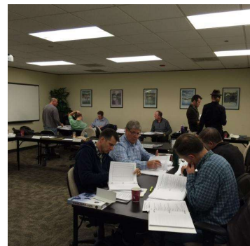
Sep 2015 - QMII worked with Washington State Ferries in Seattle.