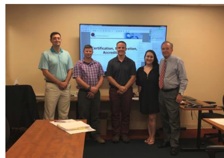
Students from a combined on-site and virtual ISO 9001 Lead Auditor Training , at our headquarters in Ashburn, VA.

For more information visit our website click here