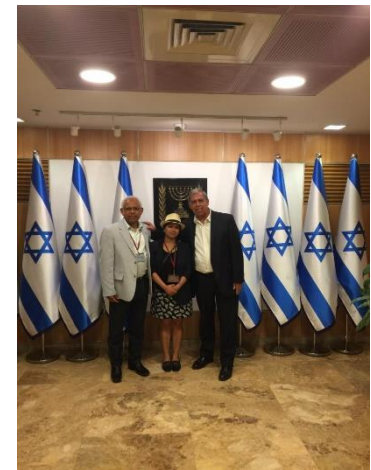
With a Member of the Parliament