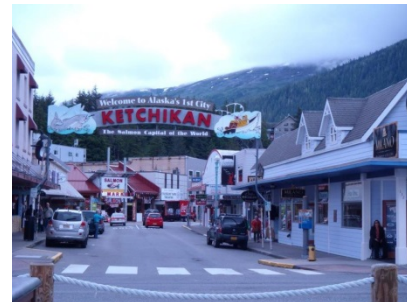
Ketchikan, AK. The Salmon capital of the world!.