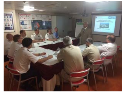
Holland America Line personnel aboard MV Zuiderdam learn about team-based problem solving using the "5 Why" technique

Thriving in a competitive global marketplace requires you to understand the capability of your processes. How do you know if you are good at what you do and if you are good at what matters? This is where CMMI® can help. CMMI is a tool that is used for process improvement and will help an organization meet business objectives. Building CMII into your processes will ensure predictability and