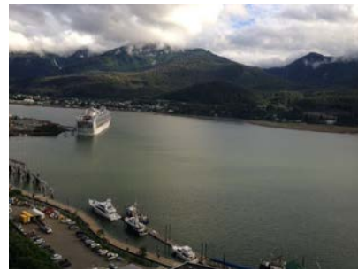
Scenic view of Gastineau Channel and Douglas Island from the top of tramway in Juneau, Alaska