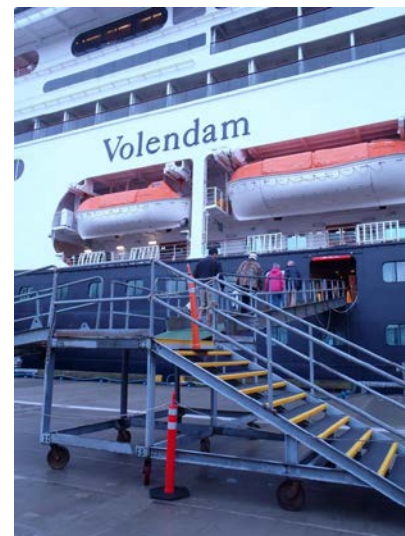
QMII also provided a Problem Solving Workshop onboard MV Volendam in Ketchikan, Alaska