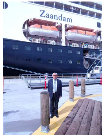
QMII President and CEO conducts a Problem Solving Workshop to personnel onboard MV Zaandam