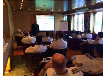
MV Statendam personnel learn about nonconformities