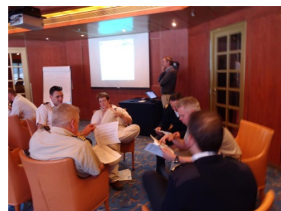
MV Zaandam personnel engaged in a group activity