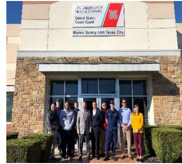
USCG MSU Texas