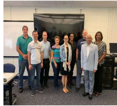
PROBITAS Authentication Certified AS 9100 Rev D Lead Auditor training conducted at the Eglin AFB for the US Air Force personnel.

QMII was also invited to conduct an Introduction to Maritime Management Systems to the Interlake Steamship Company and also attend the Interlake's Annual Winter Meeting at Kissimmee, FL.