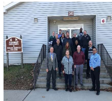
US Army Picatinny Arsenal