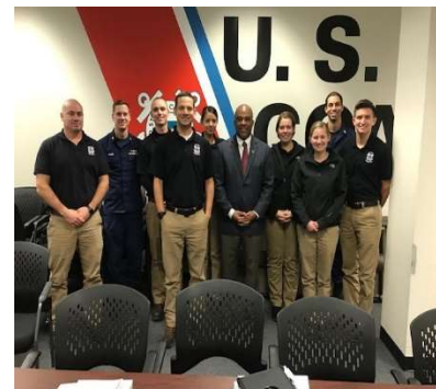
USCG Sector Boston