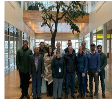
Exemplar Global Certified ISO 45001