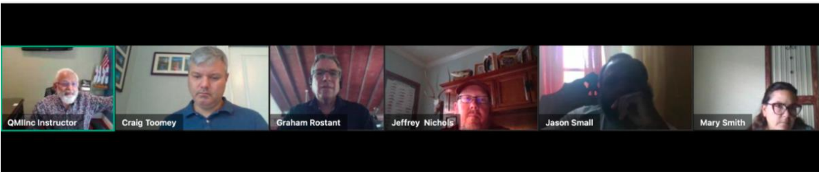
QMII President/ CEO teaching a VSO/ CFO/PFSO/ISPS class on 8/26/21.