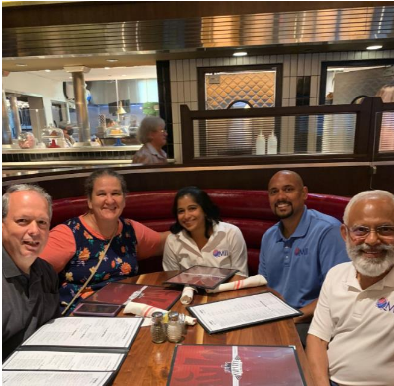
QMII Team Visits Chicago and Ohio!