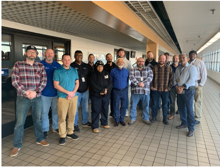
Exemplar Global certified ISO 9001:2015 Lead Auditor training delivered for the New Jersey Transit personnel at their headquarters located at New Jersey.